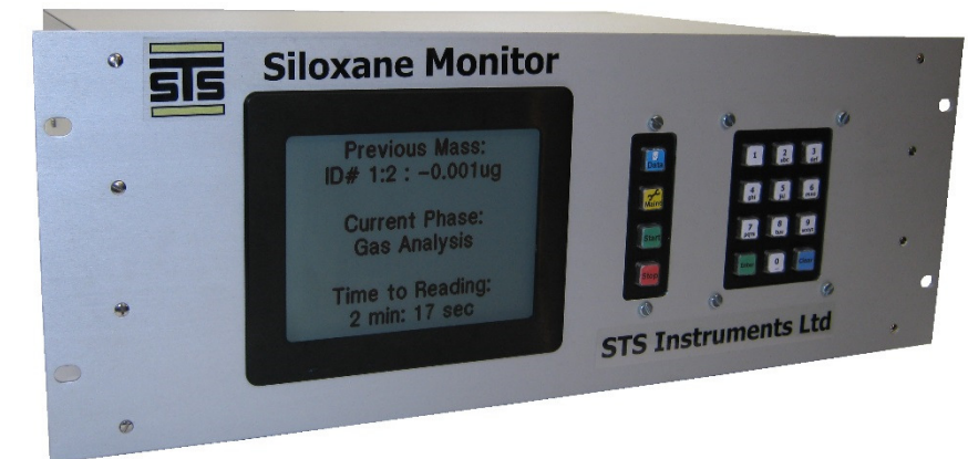
Siloxane breakthrough in a Carbon Filter removal system